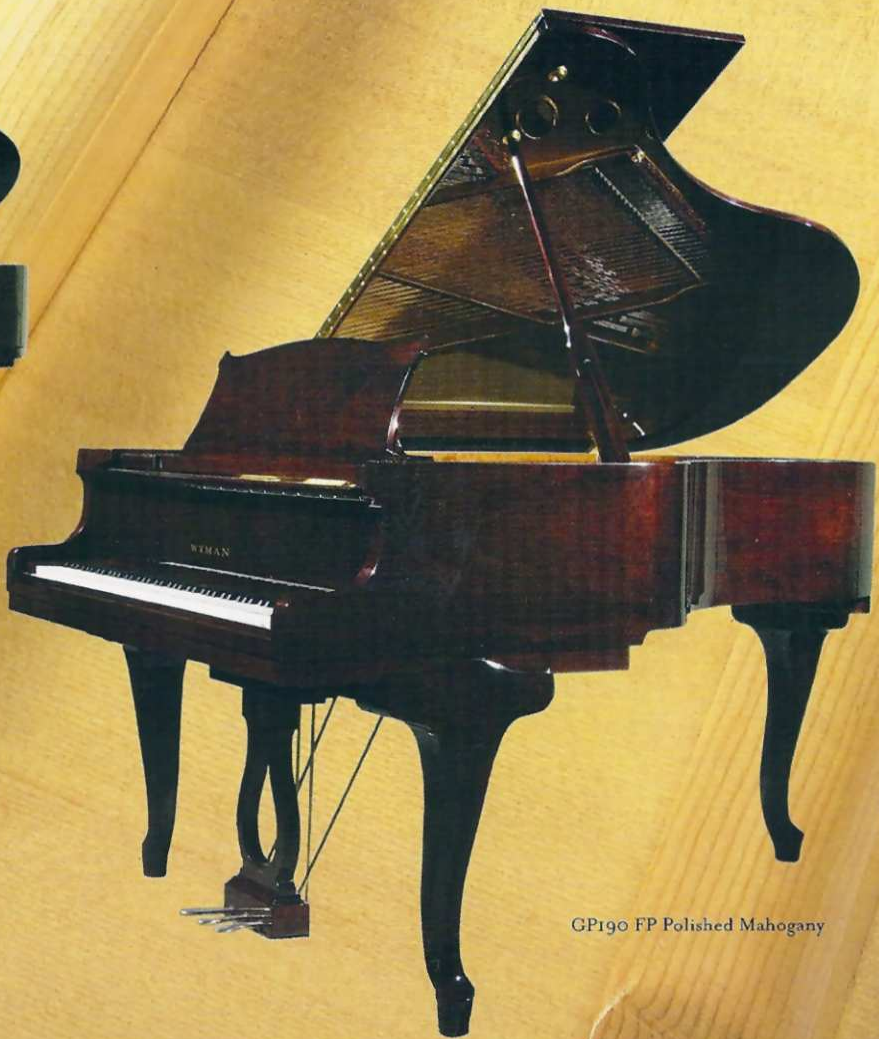
GP190 FP Polished Mahogany